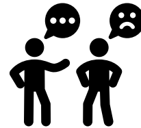
Defiance & Disrespect